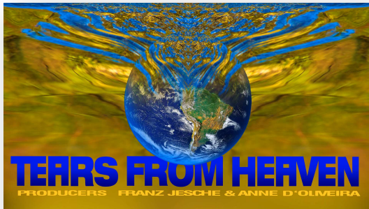
Tears from Heaven