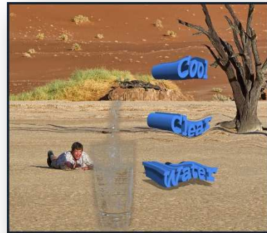
Cool Clear Water

MERIT Ice Landscape Antarctica (New Zealand) Alistair McAuslan MERIT One Winters Day (New Zealand) Elizabeth Carruthers